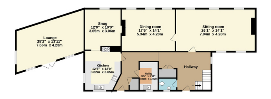
1st Floor 816 sq.ft. (75.8 sq.m.) approx.